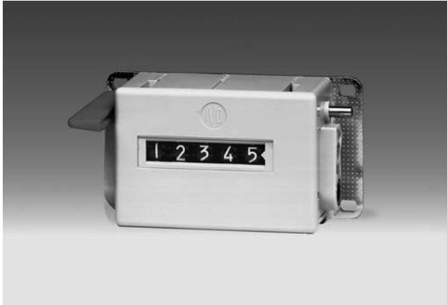
U 411 - Revolution counter