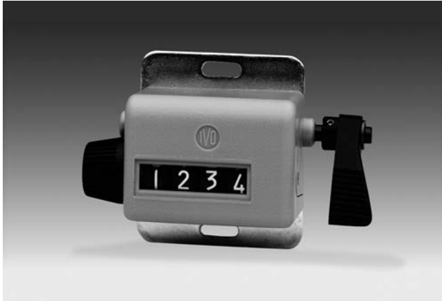
T 127 - Piece counter with lever