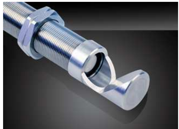
Fig. 3: 90° deflector made of stainless steel fitted to a UNAR 18

Switching and also distance measuring sensors can be operated with this accessory. Its influence on the measuring accuracy of the level sensor is practically negligible. When correctly fitted, the deflector even provides additional mechanical protection for the Parylene-coated transducer. Due to the deflector, the UNAR can also be easily used when the installation depth is very limited.