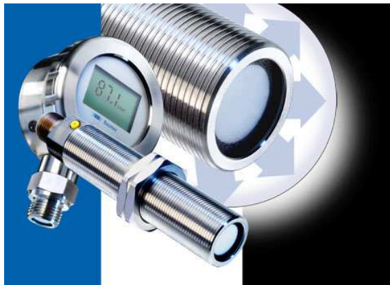
Fig. 2: The front surface of the UNAR coated with Parylene and specially sealed, including execution with an integrated digital display

At a first glance, no noticeable mechanical differences can be seen between a UNAR and a standard ultrasonic sensor of the same size. In contrast to other solutions, it was possible to avoid a bulky mechanical covering of the active surface due to the Parylene coating. The M18 thread is retained unchanged over the entire length of the housing. In particular, the latter simplifies installation (Fig. 2).