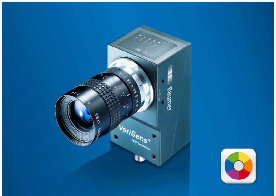
Baumer’s VeriSens® XC series vision sensor with Color FEX® .

This is bad news when it comes to sorting by color in industrial image processing – especially since clear limits are essential. Known vision sensor parameters are number of surfaces, edges, distance – always in the form of a numerical value with related minimum and maximum limit. Applying the above to the necessary third dimension makes the problem clear: Color mapping calls for three independent adjusting parameters (hue, saturation, brightness). Including associated tolerances results in six parameters per color, i.e., each with a minimum and maximum limit in the three dimensions of the color space. When it comes to color distinction, things become even more complex. Besides observing the numerous limits in relation to each other there must be no overlap in the color