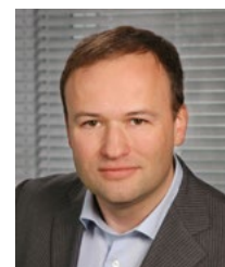
Author: Michael Steinicke Product Management Vision Competence Center

Verification of correct pencil arrangement: after color teaching in VeriSens ® Application Suite, the four colors are visualized as spheres. No collision with each other will ensure reliable color inspection.