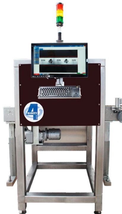
Figure 3: The products to be inspected are brought into the test box via a conveyor belt. An integrated belt receives the products and transports them through the test process. The system is set to the desired parameters.

to the verification of attached 1D and 2D codes or texts (OCR/OCV) are possible. “Our standard library consists of several thousand fonts. This allows us to allocate plain text of our customers to standard fonts such as “Document”, “Universal”, or “Pharma” for reliable readability,” explains Tukac about the OCR process.