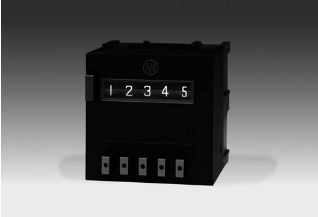
FS304 - socket box